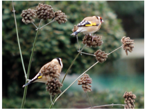
Goldfinch on Verbena bonariensis seedheads

Talking about bird feeders, we bought some new ones a few months ago that feature spring loaded perches, which allow smaller birds to feed but prevents larger, heavier birds, such as rooks, gaining access, when their weight pulls down a shutter. However, true to form, it didn't take long for the enterprising jackdaws to work out that if they hovered briefly, avoiding the perch, they could snatch some grain out of the feeder, dropping some in the process. Then peck up the droppings before flying up again to repeat the exercise. Other bird reports this month include my sighting of 8 lapwings on the backfields, which is the first time I've seen any there for some years, when, as I've mentioned in the past, there used to be flocks of hundreds of birds in the winter months. Another came from Mary Baldock and daughter Debbie who spotted goldfinches on one of their walks. Continuing with birds, a friend loaned me a fascinating book entitled Nests by Susan Ogilvy, who is a botanical artist and also fascinated by bird nests. Her beautiful watercolour paintings of the nests of a number of our garden birds are extraordinarily detailed, showing both the design and shape of each nest and the many different types of material used in the construction – moss, baling string, feathers, strands of wool and cotton, leaves, grasses, cobweb, pieces of plastic – a bit of whatever is available. Gorgeous.